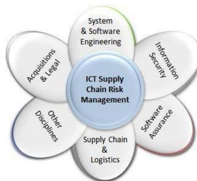
Figure 2: Components and Contributing Disciplines of ICT SCRM

Website: https://nvlpubs.nist.gov/nistpubs/SpecialPublications/NIST.SP.800-161.pdf